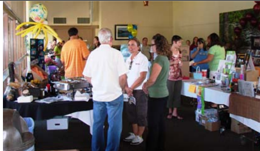
Connecting, Communicating, & Collaborating